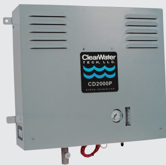
CD2000P Ozone Generator