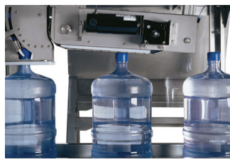
BOTTLED WATER FILL LINES