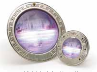
IntelliBrite 5g Pool and Spa Lights