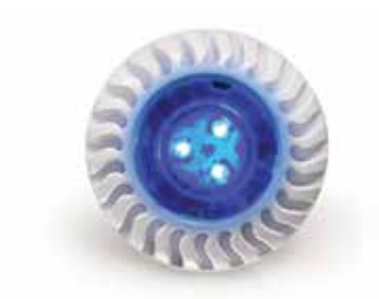
GloBrite Pool and Spa LED Light