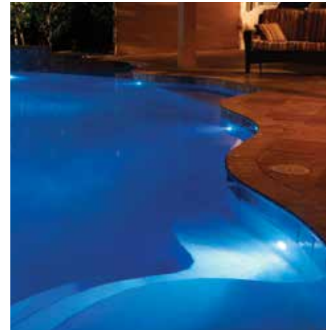
HiLite Halogen Quartz Light