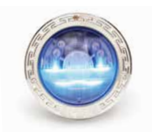
AmerBrite LED Replacement Lamp for Amerlite Housing

Amerlite Incandescent Light and Lens Covers