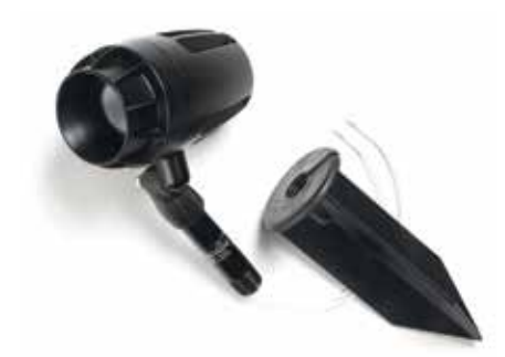
IntelliBrite Color-Changing LED Landscape Lights